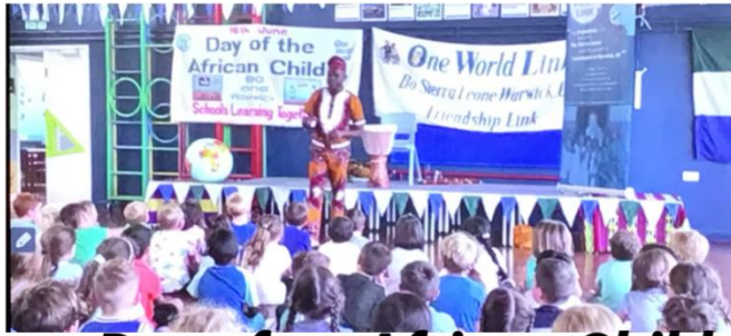
Day of an African Child.