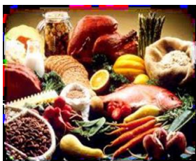
Autism and Food Issues and Strategies