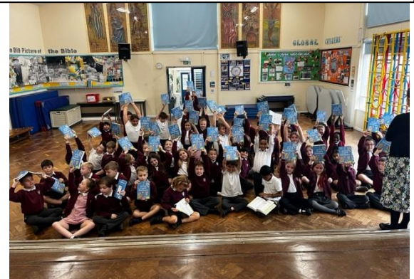
Year 4 welcomed The Rotary Club who kindly presented them all a dictionary