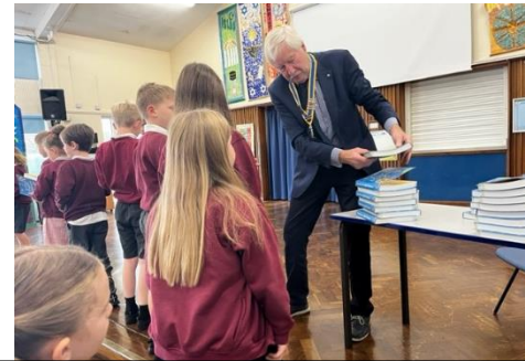
Year 4 welcomed The Rotary Club who kindly presented them all a dictionary