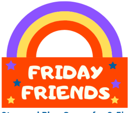
Stay and Play Group for 0-5's

www.warwickschool.org/summer-action-2019