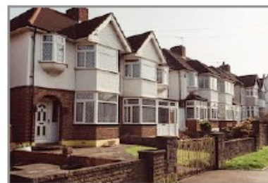
homes built in the past

Comparing and contrasting homes then and now: