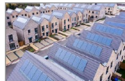
homes built recently