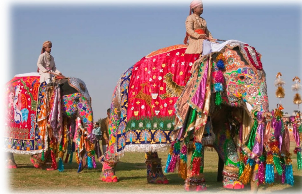
Colours and patterns at the ASIAN Jaipur elephant festival.