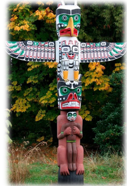
NATIVE AMERICAN totem poles with animal designs.