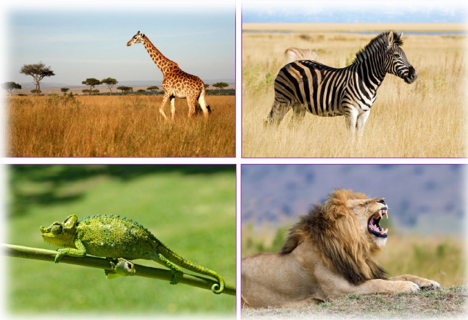
Colours and patterns of AFRICAN animals.