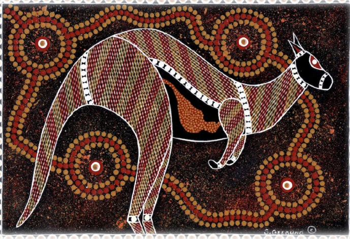
Aboriginal animal art work from AUSTRALIA.