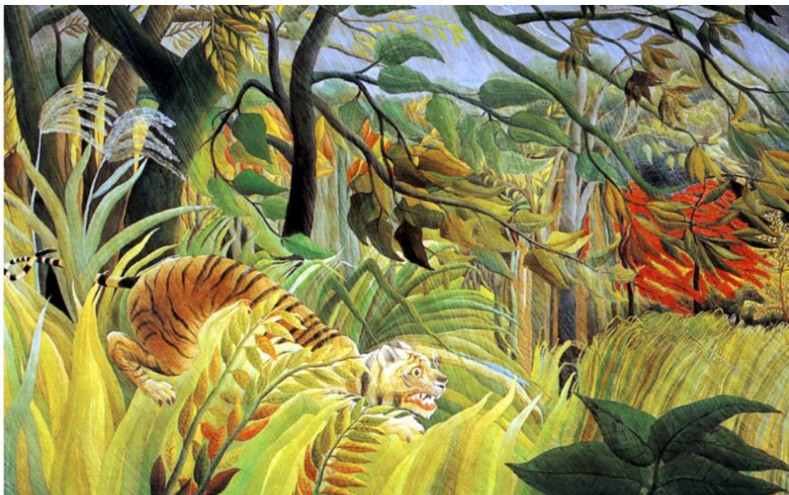
Tiger in a Tropical Storm (Surprised!), 1891 by Henri Rousseau