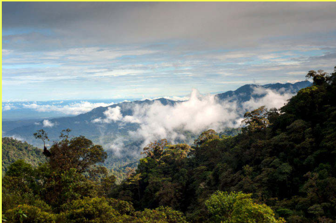
This picture shows the rainforest climate of the Andes in Ecuador.