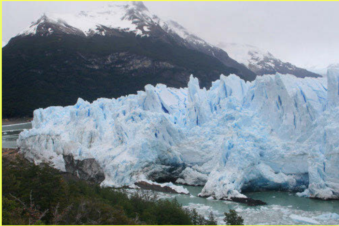
This picture shows a glacier in the Southern Andes of Argentina.